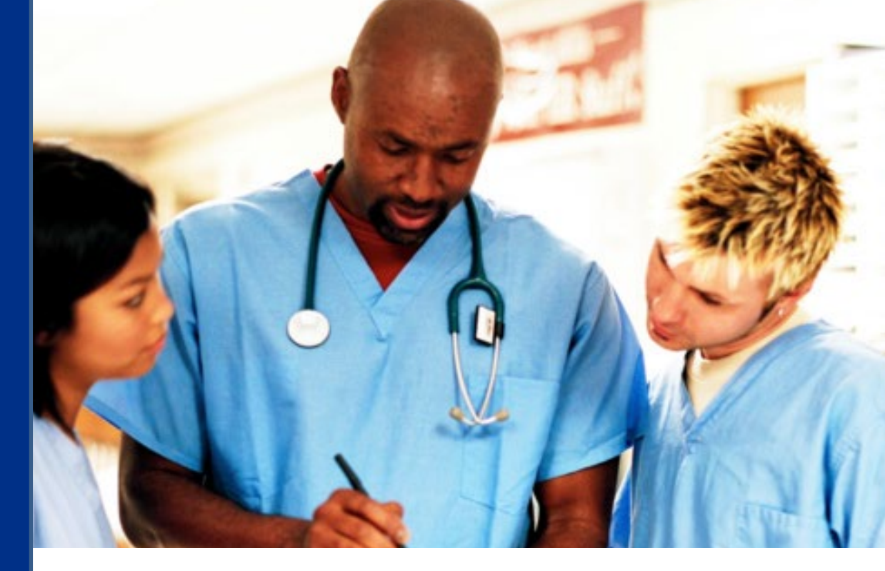
QIO Program BFCC-QIO 12th SOW